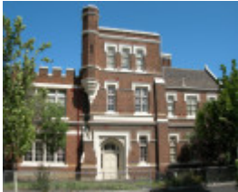
JH BOYD GIRLS HIGH SCHOOL SOHE 2008