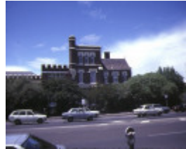
1 j h boyd girls high school city road south melbourne front view