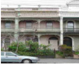
Barcelona Terrace - 29 Brunswick Street