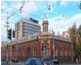
Melbourne Tramway and Omnibus Company Engine House