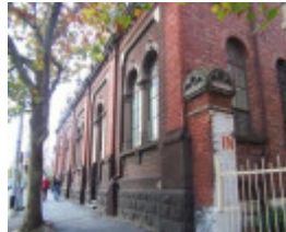
Melbourne Tramway and Omnibus Company Engine House