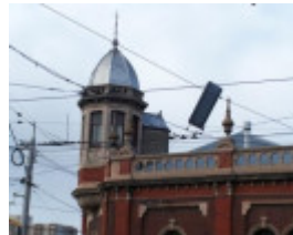
Melbourne Tramway and Omnibus Company Engine House