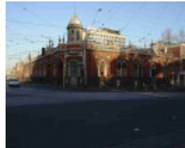
Melbourne Tramway and Omnibus Company Engine House