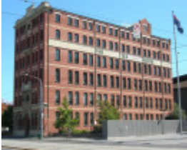
ROBUR TEA BUILDING SOHE 2008