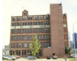
1 robur tea building clarendon street south melbourne rear view dec1992