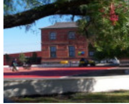
Gold Street Primary School