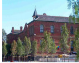
Gold Street Primary School