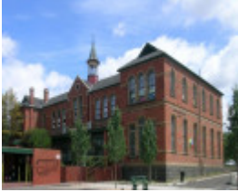
Gold Street Primary School