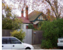
Fairfield Park Crescent 46(1).JPG