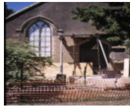
former methodist church ford street beechworth detail front