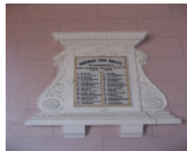
Church Honour Board