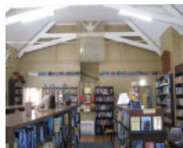
Sunday School interior