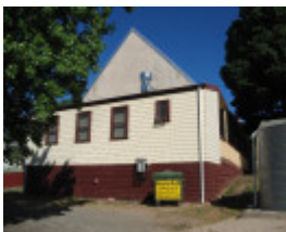
Church rear addition