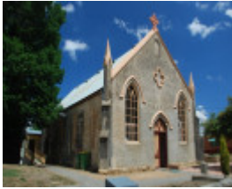
FORMER METHODIST CHURCH SOHE 2008