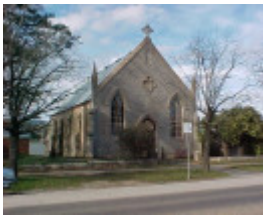
1 former methodist church ford street beechworth front elevation