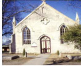
h00523 former methodist church ford st beechworth view from ford st she project 2003