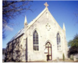
h00523 former methodist church ford st beechworth view from north she project 2003