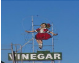
Skipping Girl Sign