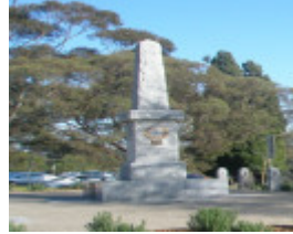
Eltham War Memorial - Current location: 903-907 Main Road Eltham - Citation for Eltham War Memorial June 2013