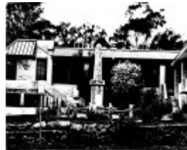
204 - War Memorial Main Road Eltham - Shire of Eltham Heritage Study 1992