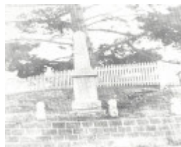
HO126 Eltham 1st and and War Memorial in original location cnr ain Road and Bridge St.jpg