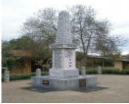
Eltham War Memorial - Current location: 903-907 Main Road Eltham - Citation for Eltham War Memorial June 2013