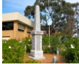
Eltham War Memorial - Second location: RSL Hall 804 Main Road Eltham - Citation for Eltham War Memorial June 2013.