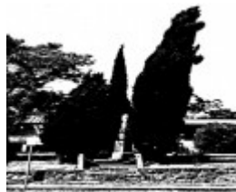
204 - War Memorial Main Road Eltham 02 - 1991 photograph showing the previous/original landscaping which has since been replaced - Shire of Eltham Heritage Study 1992