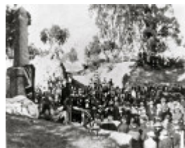
Eltham War Memorial - Original site: unveiling - Citation for Eltham War Memorial June 2013