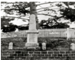
Eltham War Memorial - Original site: Corner of Main Road and Bridge Street Eltham - Citation for Eltham War Memorial June 2013