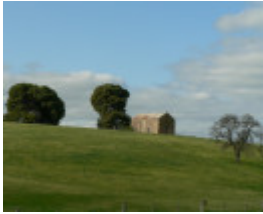
Hamilton Hwy Murgheboluc St Andrews Church