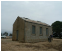
104344 Hamilton Highway St Andrew s Anglican Chapel 457