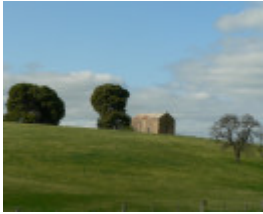
Hamilton Hwy Murgheboluc St Andrews Church