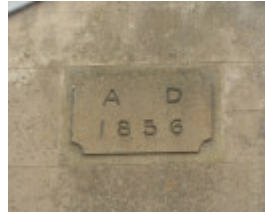
104344 Hamilton Highway St Andrew s Anglican Chapel 458