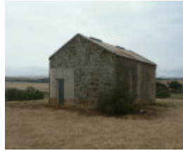
104344 Hamilton Highway St Andrew s Anglican Chapel 459