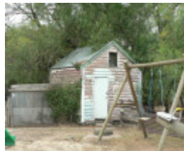
Former Harvey Farmhouse, 2000 Hamilton Highway, Murgheboluc