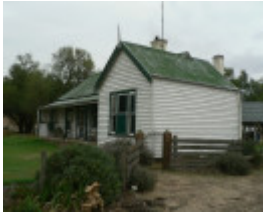
Former Harvey Farmhouse, 2000 Hamilton Highway, Murgheboluc