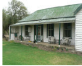
Former Harvey Farmhouse, 2000 Hamilton Highway, Murgheboluc