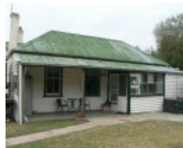
Former Harvey Farmhouse, 2000 Hamilton Highway, Murgheboluc