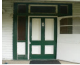
Former Harvey Farmhouse, 2000 Hamilton Highway, Murgheboluc