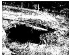
233 - Cave Cool Store St Andrews North 04 - Shire of Eltham Heritage Study 1992