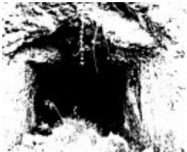
233 - Cave Cool Store St Andrews North 03 - Shire of Eltham Heritage Study 1992