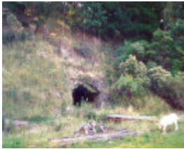
Cave Cool Store St Andrews North Colour - Shire of Eltham Heritage Study 1992