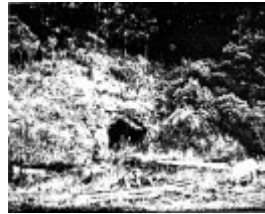
233 - Cave Cool Store St Andrews North - Shire of Eltham Heritage Study 1992