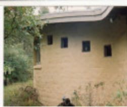
The Busst House Eltham Colour 5 - Shire of Eltham Heritage Study 1992