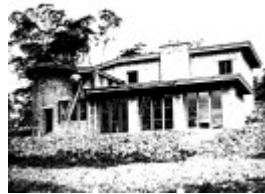
261 - The Busst House Eltham 02 - North elevation of the Busst House photographed during construction - Note the roof deck above the ground floor living room minus its balustrade which is still to be installed - Shire of Eltham Heritage Study 1992