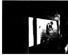
261 - The Busst House Eltham 12 - Shire of Eltham Heritage Study 1992