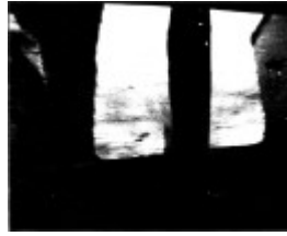
261 - The Busst House Eltham 13 - Shire of Eltham Heritage Study 1992