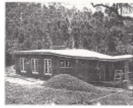
The Busst House Eltham Black & White 1 - Shire of Eltham Heritage Study 1992