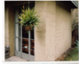
The Busst House Eltham Colour 3 - Shire of Eltham Heritage Study 1992