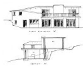
261 - The Busst House Eltham 06 - Drawing of the north elevation and section - Shire of Eltham Heritage Study 1992