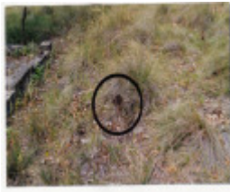
Queenstown Cemetery Colour 4 - Shire of Eltham Heritage Study 1992