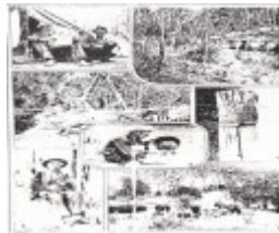
Queenstown Cemetery Mining 2 - Shire of Eltham Heritage Study 1992