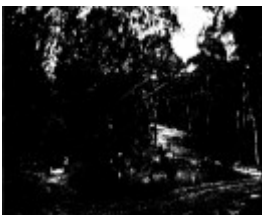
263 - Queenstown Cemetery 07 - Shire of Eltham Heritage Study 1992