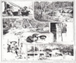
Queenstown Cemetery Mining 1 - Shire of Eltham Heritage Study 1992