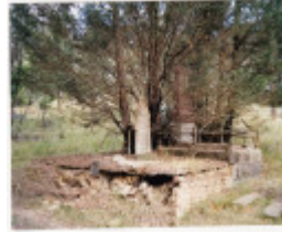
Queenstown Cemetery Colour 2 - Shire of Eltham Heritage Study 1992