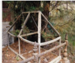
Queenstown Cemetery Colour 3 - Shire of Eltham Heritage Study 1992