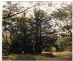
Queenstown Cemetery Colour 8 - Shire of Eltham Heritage Study 1992