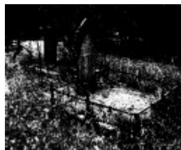
263 - Queenstown Cemetery 09 - Shire of Eltham Heritage Study 1992