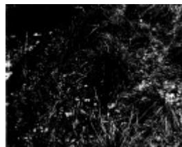
263 - Queenstown Cemetery 08 - Shire of Eltham Heritage Study 1992