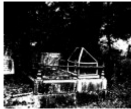
263 - Queenstown Cemetery 06 - Shire of Eltham Heritage Study 1992