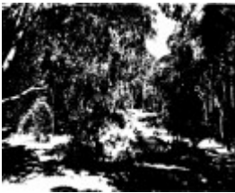
263 - Queenstown Cemetery 04 - Shire of Eltham Heritage Study 1992