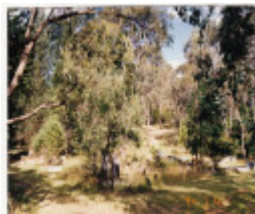
Queenstown Cemetery Colour 7 - Shire of Eltham Heritage Study 1992