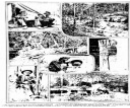
263 - Queenstown Cemetery 02 - Relics of the old mining days in the Queenstown district, The Leader, date unknown - includes a photograph of the cemetery. Note the well-kept nature of this cemetery then and the young cypress trees (ELHPC No.161) - Shire o