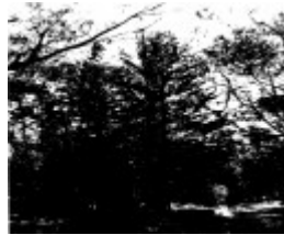
263 - Queenstown Cemetery 03 - Shire of Eltham Heritage Study 1992