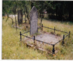
Queenstown Cemetery Colour 1 - Shire of Eltham Heritage Study 1992