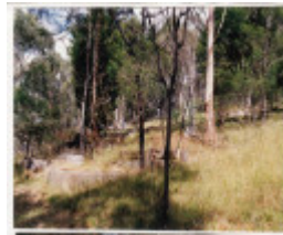
Queenstown Cemetery Colour 5 - Shire of Eltham Heritage Study 1992