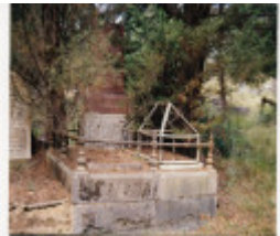
Queenstown Cemetery Colour 6 - Shire of Eltham Heritage Study 1992