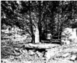
263 - Queenstown Cemetery - Shire of Eltham Heritage Study 1992