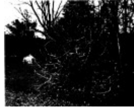
268 - Sweeneys Cottage Eltham 14 - Shire of Eltham Heritage Study 1992