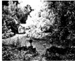
268 - Sweeneys Cottage Eltham 18 - Shire of Eltham Heritage Study 1992