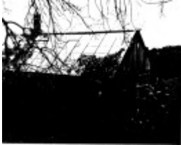
268 - Sweeneys Cottage Eltham 13 - Shire of Eltham Heritage Study 1992