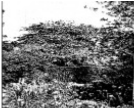
268 - Sweeneys Cottage Eltham 16 - 100 year old pear tree - Shire of Eltham Heritage Study 1992