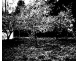
268 - Sweeneys Cottage Eltham 15 - Apple Orchard Trees - Shire of Eltham Heritage Study 1992