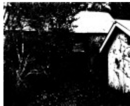
268 - Sweeneys Cottage Eltham 06 - Shire of Eltham Heritage Study 1992