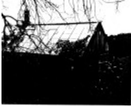
268 - Sweeneys Cottage Eltham 13 - Shire of Eltham Heritage Study 1992