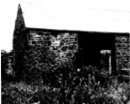
268 - Sweeneys Cottage Eltham 04 - 1949? photograph of the barn - Shire of Eltham Heritage Study 1992