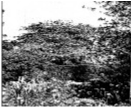
268 - Sweeneys Cottage Eltham 16 - 100 year old pear tree - Shire of Eltham Heritage Study 1992