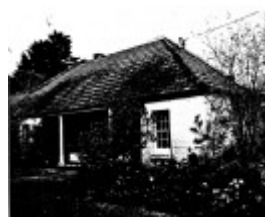
268 - Sweeneys Cottage Eltham 02 - Shire of Eltham Heritage Study 1992