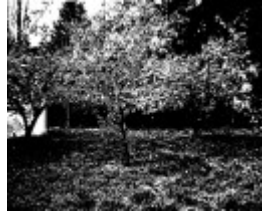
268 - Sweeneys Cottage Eltham 15 - Apple Orchard Trees - Shire of Eltham Heritage Study 1992