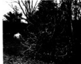
268 - Sweeneys Cottage Eltham 14 - Shire of Eltham Heritage Study 1992