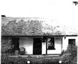
268 - Sweeneys Cottage Eltham - Shire of Eltham Heritage Study 1992