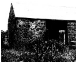
268 - Sweeneys Cottage Eltham 04 - 1949? photograph of the barn - Shire of Eltham Heritage Study 1992