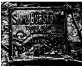
268 - Sweeneys Cottage Eltham 19 - Shire of Eltham Heritage Study 1992