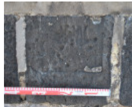
Burial Marker. Unknown. Image taken 17 Jan 2012..JPG