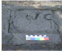
PROV2206 Grave markers 30 Jan 2009