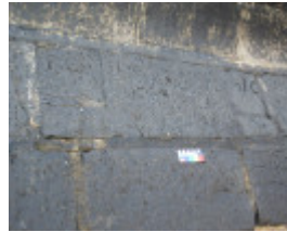
PROV2206 Grave markers 30 Jan 2009