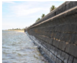
Bluestone sea wall. Image taken 17 Jan 2012