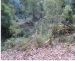
Kelly Camp site H2123 IMG 0804