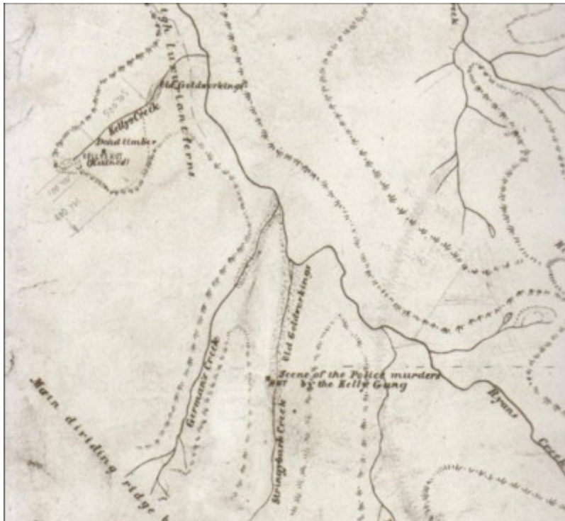
H2123 1884 Surveyors Plan