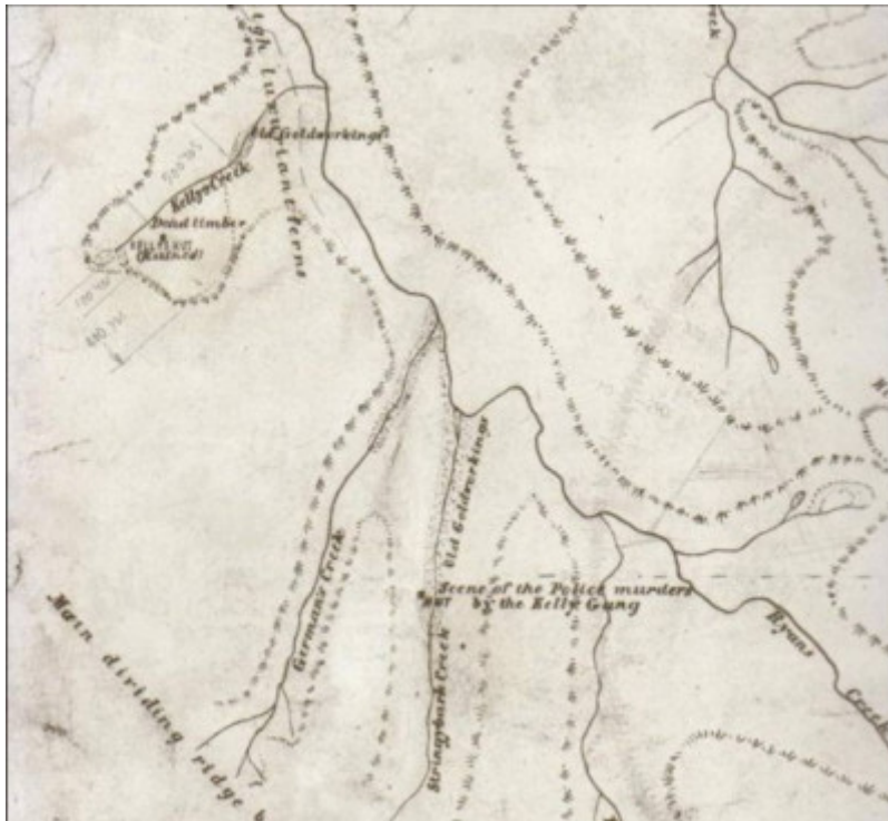
H2123 1884 Surveyors Plan