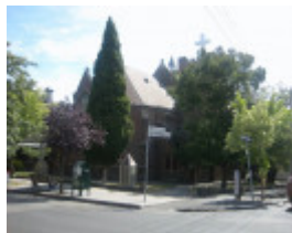
St Martin's Anglican Church