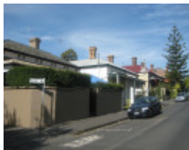
Victorian villas and cottages on the north side of Wilson Street