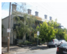
Victorian terrace, 66-74 Wilson Street