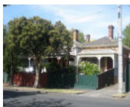
Victorian cottages, 46-48 Surrey Road