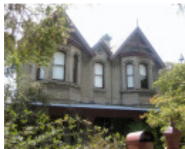
St Martin's Anglican church vicarage