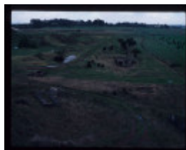
WONTHAGGI EASTERN AREA (NOS. 1 & 3 TUNNELS)