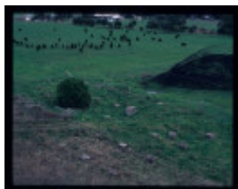
WONTHAGGI EASTERN AREA (NOS. 1 & 3 TUNNELS)