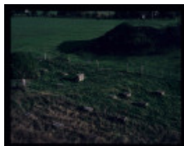
WONTHAGGI EASTERN AREA (NOS. 1 & 3 TUNNELS)