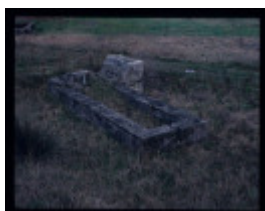
WONTHAGGI EASTERN AREA (NOS. 1 & 3 TUNNELS)