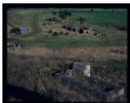
WONTHAGGI EASTERN AREA (NOS. 1 & 3 TUNNELS)