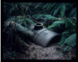
ADA NO.2 MILL