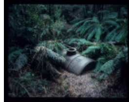
ADA NO.2 MILL