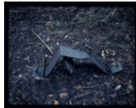
ADA NO.2 MILL