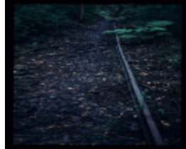
ADA NO.2 MILL