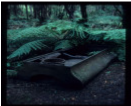
ADA NO.2 MILL