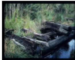
ADA NO.2 MILL