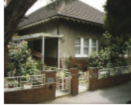
1 83 89 montague street south melbourne front gates & entrance