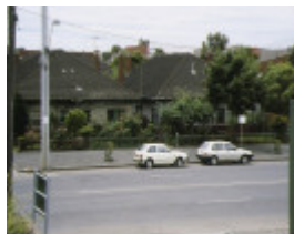
1 83 89 montague street south melbourne front view of row