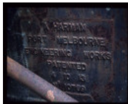
BIG CREEK ROAD WINCH SITE