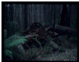
BIG CREEK ROAD WINCH SITE