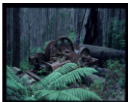
BIG CREEK ROAD WINCH SITE