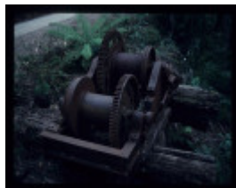
BIG CREEK ROAD WINCH SITE