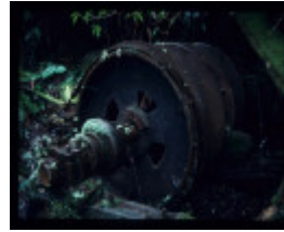
CEMENT CREEK INCLINE, WARBURTON