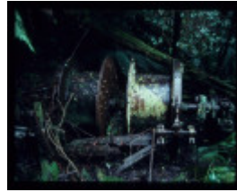
CEMENT CREEK INCLINE, WARBURTON