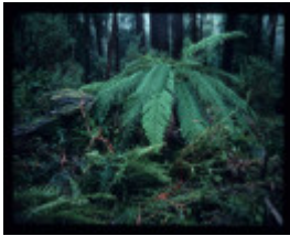
CEMENT CREEK INCLINE, WARBURTON