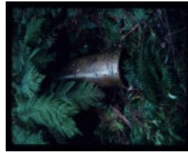
CEMENT CREEK INCLINE, WARBURTON