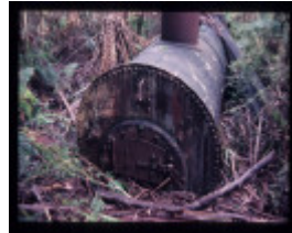
BARNEWALL & LEE'S LOWERING GEAR