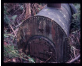
BARNEWALL & LEE'S LOWERING GEAR