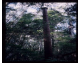
BARNEWALL & LEE'S LOWERING GEAR