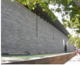
NATIONAL GALLERY OF VICTORIA SOHE 2008