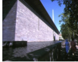
1 national gallery of victoria st kilda road melbourne front view