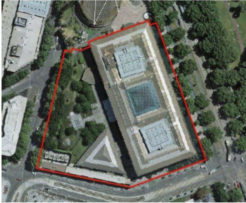
2021 NGV aerial diagram