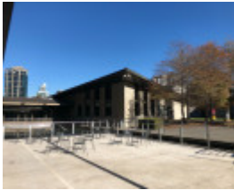
2021 NGV Former Art School