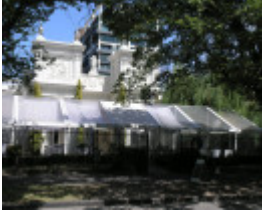
RATHGAEL - THE WILLOWS SOHE 2008