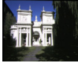
1 rathgael former estella now the willow 462 stkilda rd melb external front view