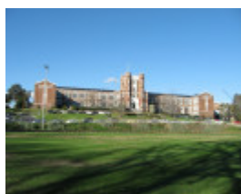
H1636 MHS view from NW June 2009