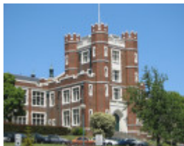
MELBOURNE HIGH SCHOOL SOHE 2008