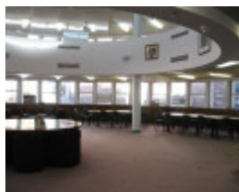
H1636 MHS library interior June 2009