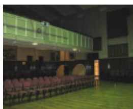
H1636 MHS memorial hall interior June 2009