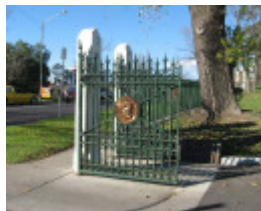
H1636 MHS gates June 2009