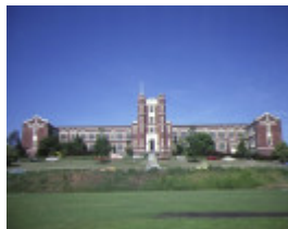
1 melbourne boys high school alexandra avenue south yarra front view nov1984