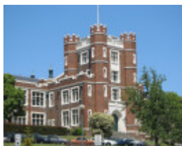
H1636 H1636Melb High 2007