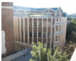
H1636 MHS library June 2009