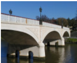
h01440 morell bridge anderson st over yarra river south yarra distant view she project 2004