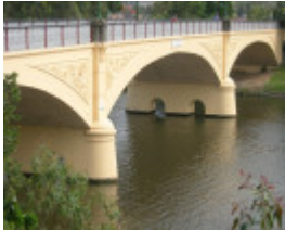
MORELL BRIDGE SOHE 2008