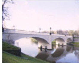
1 morell bridge over yarra river south yarra side view sep1998