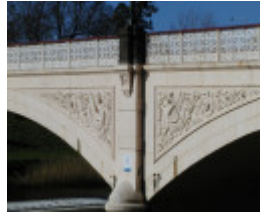
h01440 morell bridge anderson st over yarra river south yarra close up she project 2004