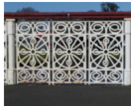
h01440 morell bridge anderson st over yarra river south yarra iron work she project 2004