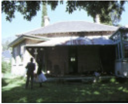
1 residence 64 avoca street south melbourne front view