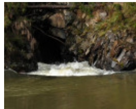
Inlet pool, rock bar and inlet of the diversion tunnel (north end of site)