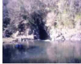
h01990 1 thomson river diversion tunnel entrance