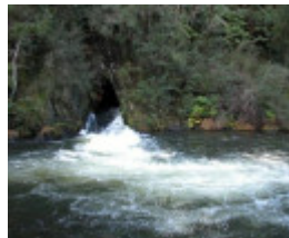
outlet pool at the outlet end of the diversion tunnel (south end of site)