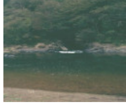
h01990 thomson tunnel