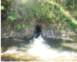
THOMSON RIVER DIVERSION TUNNEL SOHE 2008