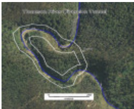
Aerial photograph of the Thomson River Diversion Tunnel Site showing current registration.jpg