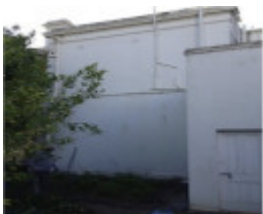
Before Photograph - Reference F3856 2014