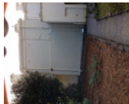
After Photograph - Reference F3856 2016