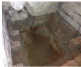
Before Photograph - Reference F3856 2014