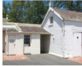
COMO HOUSE SOHE 2008