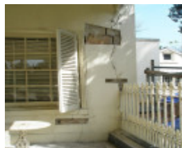
During Photograph - Reference F3856 2015