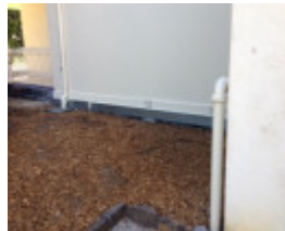
After Photograph - Reference F3856 2016