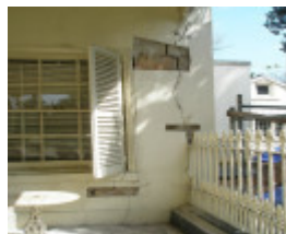
During Photograph - Reference F3856 2015