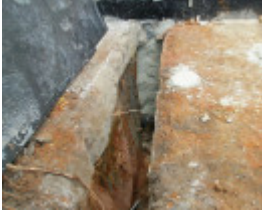
During Photograph - Reference F3856 2015