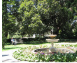
COMO HOUSE SOHE 2008