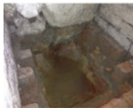
Before Photograph - Reference F3856 2014