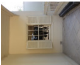
After Photograph - Reference F3856 2016