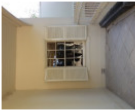
After Photograph - Reference F3856 2016