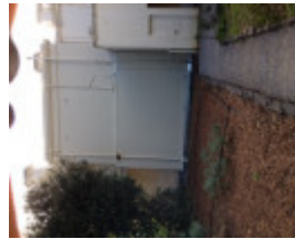
After Photograph - Reference F3856 2016