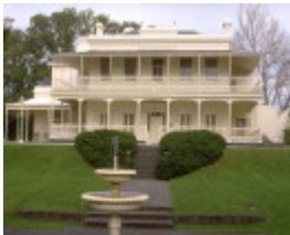
h00205 como house 01