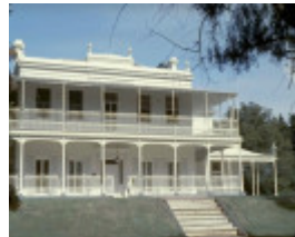
h00205 como house 02