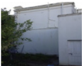
Before Photograph - Reference F3856 2014