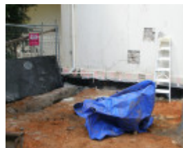
During Photograph - Reference F3856 2015