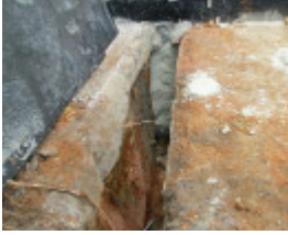
During Photograph - Reference F3856 2015