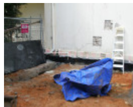
During Photograph - Reference F3856 2015