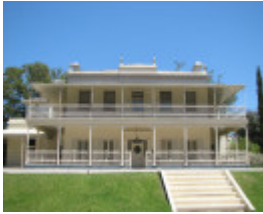
COMO HOUSE SOHE 2008