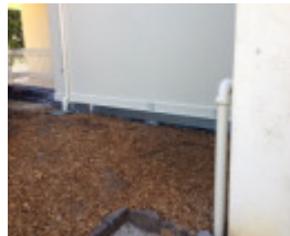
After Photograph - Reference F3856 2016