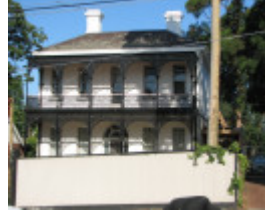
BARWON SOHE 2008