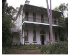
1 barwon cromwell road south yarra front view