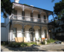
BARWON SOHE 2008