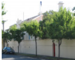
TINTERN SOHE 2008