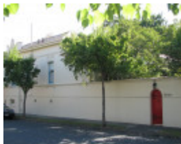
TINTERN SOHE 2008