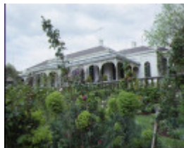
1 tintern tintern avenue toorak front view