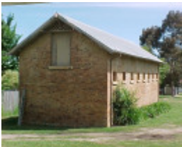
Police Stables Ford Street Beechworth November 99