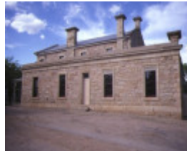
beechworth courthouse ford street beechworth side view dec1984