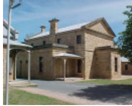
1 beechworth courthouse ford street beechworth front view nov99