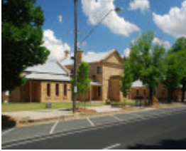
BEECHWORTH JUSTICE PRECINCT SOHE 2008