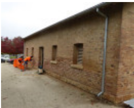
During Photograph - Reference F3879 2015