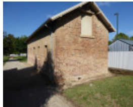
After Photograph - Reference F3879 2016