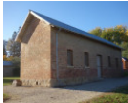
Before Photograph - Reference F3879 2014