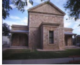
beechworth courthouse ford street beechworth front view dec1984