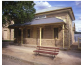
Lands Office Ford Street Beechworth Front View December 1984