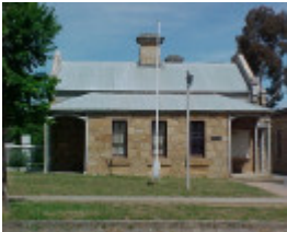
Police Station Ford Street Beechworth Front View November 99