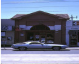
1 former south yarra railway station toorak road south yarra front view