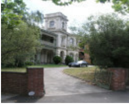
HALCYON SOHE 2008