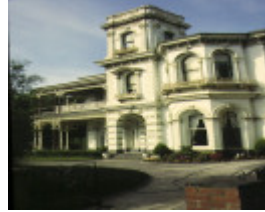
1 halcyon acland street st kilda front view dec1994

Detailed site plan of the above allotment. Hatched buildings are included on the Registration.