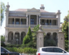
THE MANSE SOHE 2008