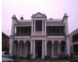
1 the presbyterian manse barkley street st kilda front view