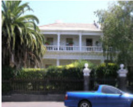
WILGAH SOHE 2008