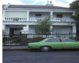
1 residence 8 burnett street st kilda front elevation mar1989