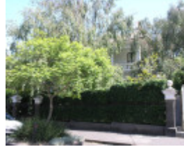
WILGAH SOHE 2008