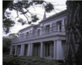
1 oberwyl burnett street st kilda view of balcony & amp; columns