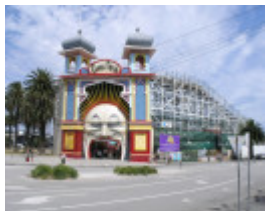
LUNA PARK SOHE 2008