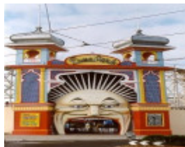
1 luna park h938 entrance april 2000