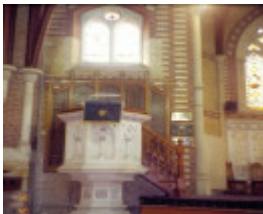
h00864 st george uniting church chapel st st kilda pulpit she project 2003