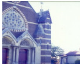
h00864 st georges uniting church chapel street st kilda south side turret she project 2003