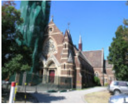
ST GEORGES UNITING CHURCH SOHE 2008