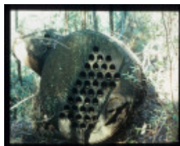
DEPTFORD PROPRIETARY MINE