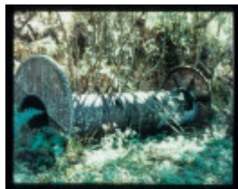
DEPTFORD PROPRIETARY MINE