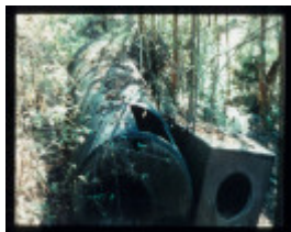
DEPTFORD PROPRIETARY MINE