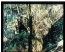
DEPTFORD PROPRIETARY MINE