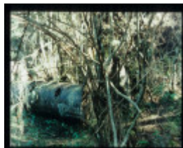
DEPTFORD PROPRIETARY MINE