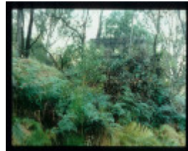
CASSILIS GOLD MINING COMPANY TREATMENT WORKS