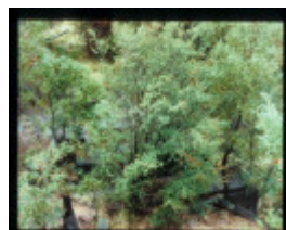
CASSILIS GOLD MINING COMPANY TREATMENT WORKS