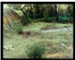
CASSILIS GOLD MINING COMPANY TREATMENT WORKS