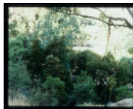
CASSILIS GOLD MINING COMPANY TREATMENT WORKS