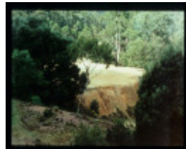
CASSILIS GOLD MINING COMPANY TREATMENT WORKS