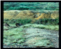
CASSILIS GOLD MINING COMPANY TREATMENT WORKS