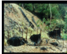
CASSILIS GOLD MINING COMPANY TREATMENT WORKS