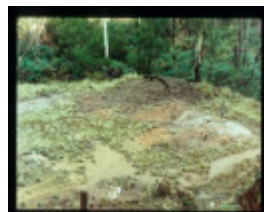
CASSILIS GOLD MINING COMPANY TREATMENT WORKS