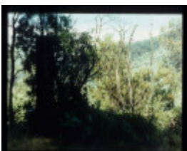
CASSILIS GOLD MINING COMPANY TREATMENT WORKS