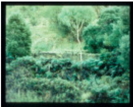
CASSILIS GOLD MINING COMPANY TREATMENT WORKS