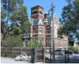
PRIMARY SCHOOL NO.2460 SOHE 2008