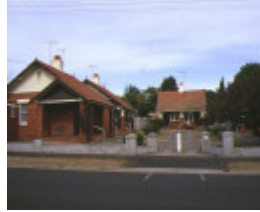
1 alexander miller memorial homes 22 park street geelong complex view apr1997