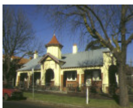
1 alexander miller memorial homes 73 mckillop street geelong front view