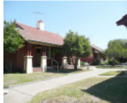
ALEXANDER MILLER MEMORIAL HOMES SOHE 2008