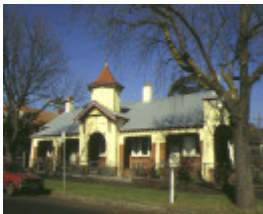
1 alexander miller memorial homes 73 mckillop street geelong front view