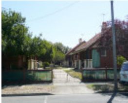
ALEXANDER MILLER MEMORIAL HOMES SOHE 2008