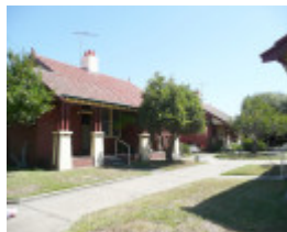
ALEXANDER MILLER MEMORIAL HOMES SOHE 2008