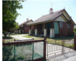
ALEXANDER MILLER MEMORIAL HOMES SOHE 2008