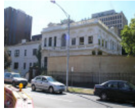
AIRLIE SOHE 2008