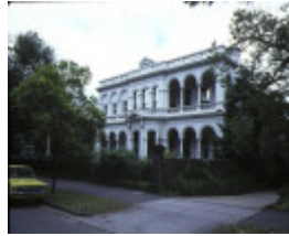
1 airlie st kilda road south melbourne view from street