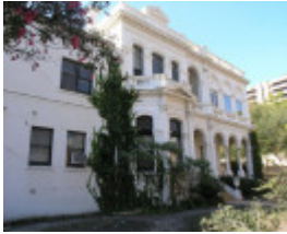
AIRLIE SOHE 2008