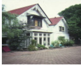
1_Wattle House Jackson Street St Kilda Front View Nov 1985