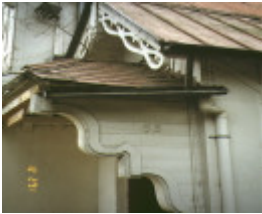
Wattle House Jackson Street St Kilda Entrance Portico Sep 1991