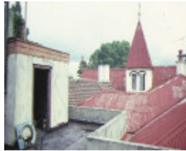
Wattle House Jackson Street St Kilda View of Roof Nov 1985