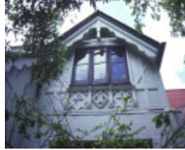
Wattle House Jackson Street St Kilda Detail of Front Window Nov 1985