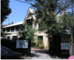
WATTLE HOUSE SOHE 2008