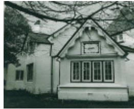
H0632 b1893 wattle house 53 jackson st st kilda large